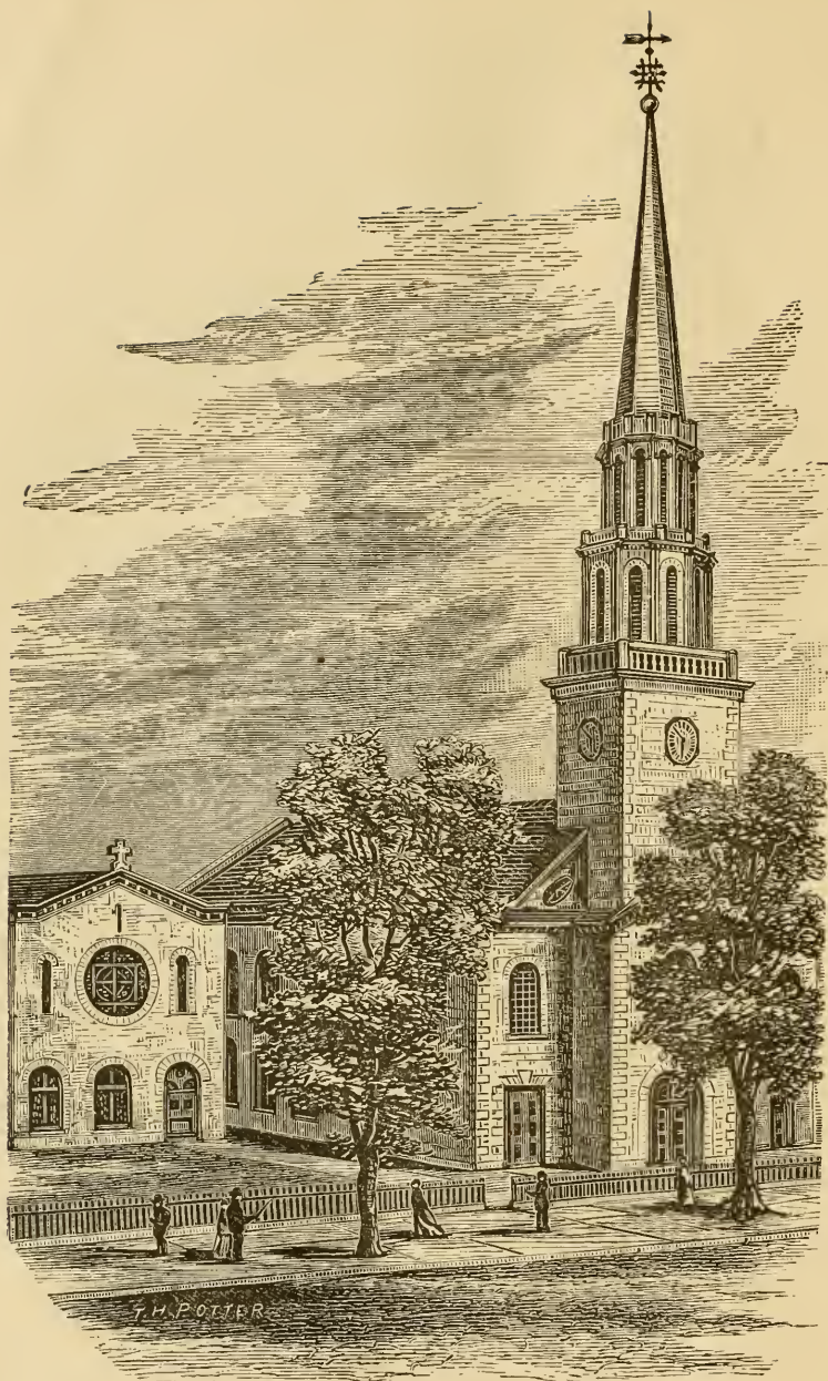
FIRST PRESBYTERIAN CHURCH, NEWARK, N. J.

Corner Stone laid September, 1787. Opened for worship January 1, 1791.